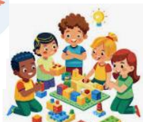
Lego & Games Club