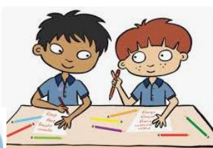
Writing & Drawing Club