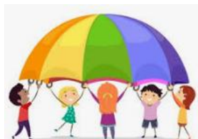
Ribbon/ Parachute Games