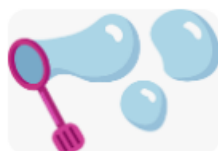
Big Bubble Club